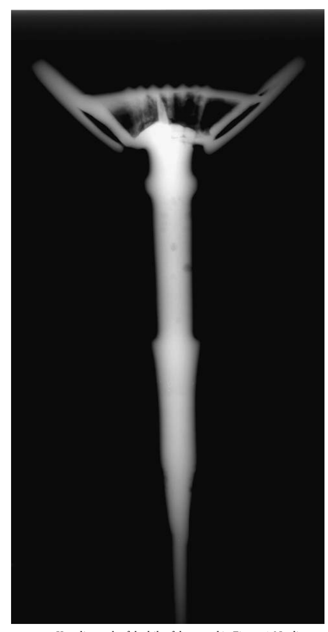
FIGURE 5. X-radiograph of the hilt of the sword in Figure 4. No discontinuities are visible either between the blade and hilt or within the hilt. The end of the tang can be seen protruding from the top of the hilt into the hollow pommel

All the components – blades and hilts – were analysed qualitatively by XRF of the uncleaned surfaces and found to be bronzes with trace levels of lead, silver and arsenic, and in some cases also antimony and nickel. The unexpected feature of all but one of the hilts is that the tip of an iron pin or tang protruded from the top. The response to a magnet confirms that the iron continues inside the bronze handgrip to the bottom of each hilt. Furthermore, the hilt frag-