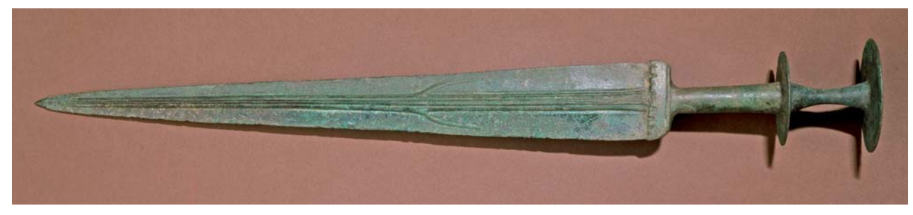
FIGURE 2. Sword with 'cotton-reel' pommel: British Museum 1968,1012.20 (ME 135054)

Both the patina and metal composition of the components are compatible with ancient manufacture and burial for many centuries, but the X-radiographic image indicates some peculiarities in the structure of the hilt, which cannot be consistent with a working weapon. It is concluded that although the components are ancient, they did not originally belong together and, moreover, that the original blade that belonged to the upper part of the hilt was of iron, not bronze.