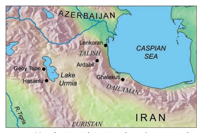
FIGURE 1. Map of regions and sites in north west Iran mentioned in the paper