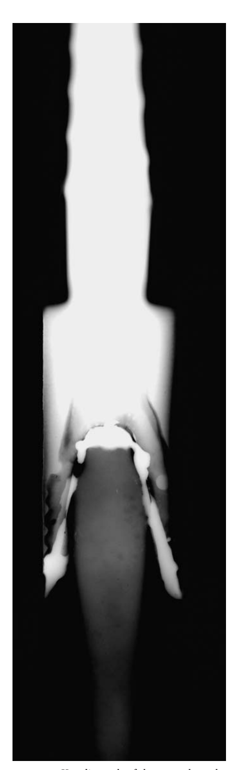
FIGURE 7. X-radiograph of the area where the hilt and blade join on the sword illustrated in Figure 6. Note the discontinuities and the white globular feature, which is soft solder

Iran is rich in metal resources and has a tradition of metalworking extending since at least the fifth millennium BC [31-33]. The working of bronze and iron, including the practice of casting bronze onto iron (for example in blades, axes and pins), became particularly highly developed in parts of western and north western Iran during the second and early first millennium BC, and are known both through excavation and finds circulating via the art market over the past century. Typological studies and archaeological reports provide a framework and better appreciation of the circulation of some of the main classes of object but the number of scientific analyses is still very small and a healthy degree of caution should be exercised over the interpretation of objects lacking archaeological provenance. The skills of Iranian craftsmen are not limited to antiquity and practical knowledge combined with personal gain has proved a powerful combination. As early as 1930, one Iranian dealer