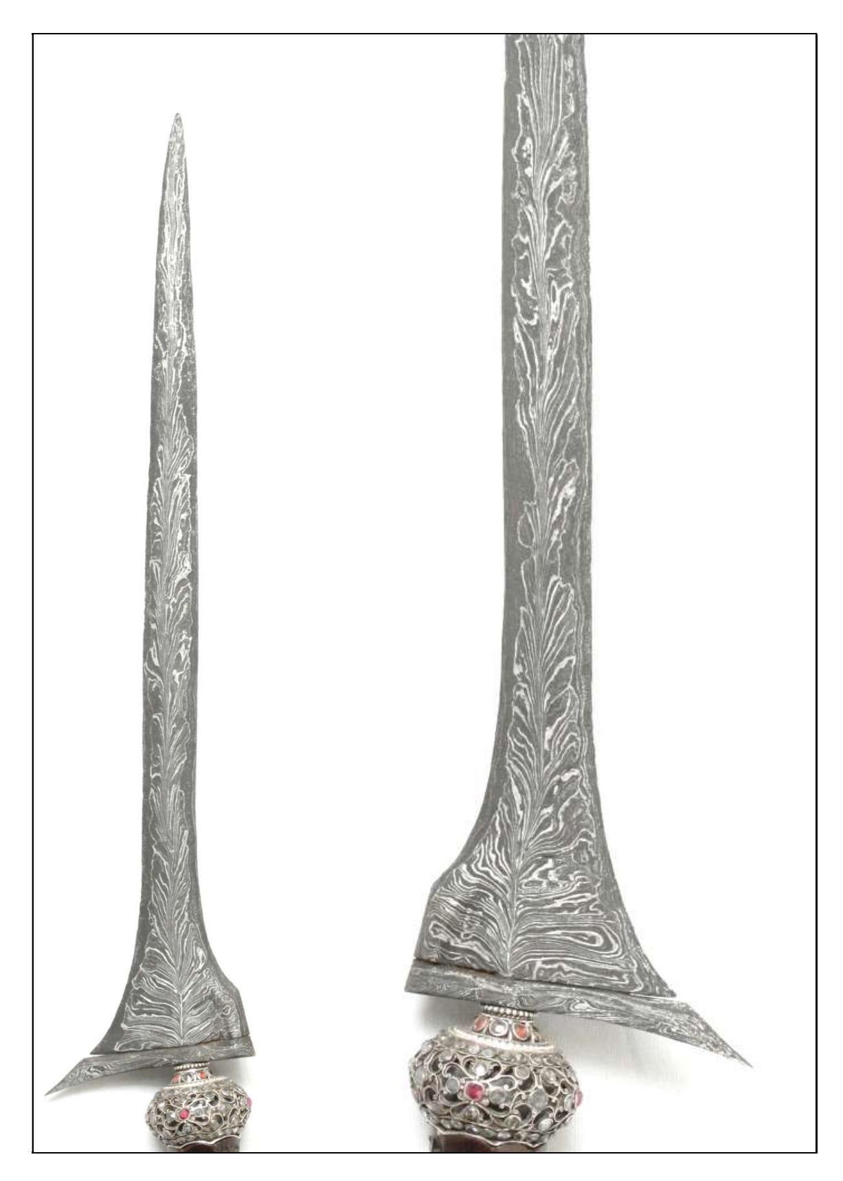
Picture 2.2.4: An old straight blade showing a finely made pamor pattern identified as Blarak Ngirid/ Sineret "coconut palm leaf" or Sekar Glagah "Kans grass flowers", and consisting of stacked V-shaped motifs along the center of the blade. It is deemed to increase the authority and leadership abilities of the kris owner.