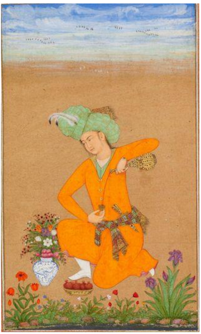
A prince in Persian costume pouring wine. Inscribed on the bowl in Persian: 'amal-i Muhammad Khan musavvir sanna 1043 ('work of Muhammad Khan the artist, the year 1043/1633—4'). Add.Or.3129, f. 21v.

While vases of flowers are occasionally seen in contemporary Mughal party scenes, they are normally slender and filled with a single type of flower arranged in two dimensions. This extravagant bouquet in Muhammad Khan's painting seems instead derived from a European exemplar, such as occur in several engraved florilegia of the late 16<sup>th</sup> and early 17<sup>th</sup> centuries. In one of them, the Florilegium series of prints made by <u>Adriaen Collaert</u> and published by Philips Galle in Antwerp, first in 1587 and again in 1590, the third plate is an elaborate bouquet of various flowers arranged in a vase much as in Muhammad Khan's version.