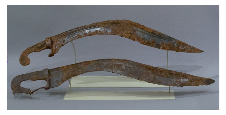
FIGURE 2 Two Greek kopides, fifth century (Metropolitan Museum cat. nos. 2001.543 and 2001.346).