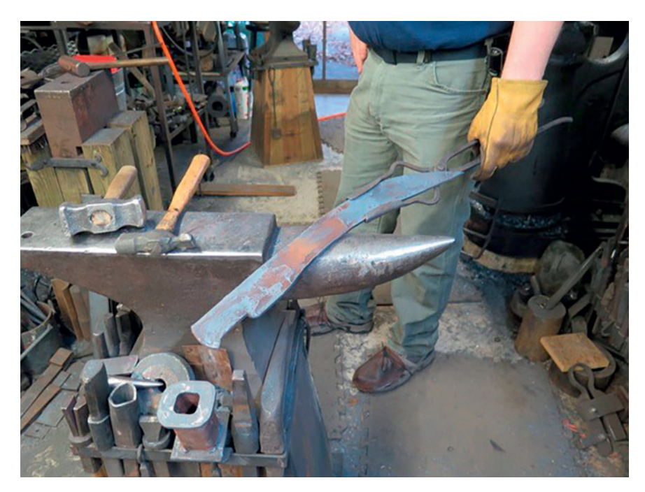
FIGURE 12 The replica kopis , after three cycles of heating in the forge and hammering.

in which the haft of the hammer is perpendicular to the arm when clenched tightly in a fist (Figure 13 here). The kopis ' unevenly tapering handle tilts the blade about thirty degrees away from perpendicular, with the blade and tip leaning away from the swordsman's body and shifts the hand position to that of a handshake-like grip, rather than the hammer grip.