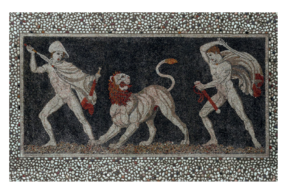
FIGURE 10 Detail of the Lion Hunt Mosaic from Pella, fourth century (Pella Archaeological Museum). The weapon in this youth's hand has the characteristic forward curve, reinforced back edge ridge, hooked hilt, and single projecting quillon of a kopis. Note that the youth depicted here wields a kopis in a backhand stroke (Wikimedia Commons CCo).

Detail of the tondo of a kylix by the Triptolemos Painter, ca. 480–470. A hoplite on the right is using a kopis in a backhand cut to kill the fallen Persian on the left, who is wielding some sort of sabre, perhaps the Persian akinakês, in his right hand and a bow in his left. (Edinburgh Royal Scottish Museum inv. 1887.213, ARV<sup>2</sup> 464.46) (Wikimedia Commons CCo).