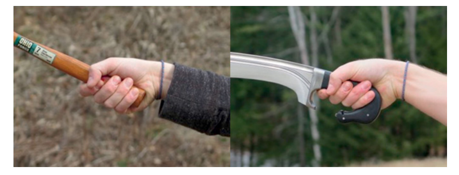
FIGURE 13 Left: hammer-grip on a straight-handled hammer. Right: handshake-grip caused by the tapering-handled kopis.