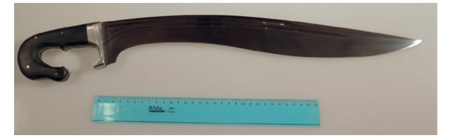
FIGURE 11 The finished replica kopis.