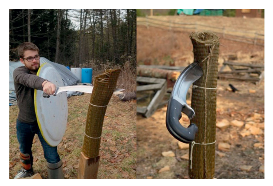
FIGURE 16 Results of a stab into a tatami mat. Right: the replica kopis embedded in the tatami.