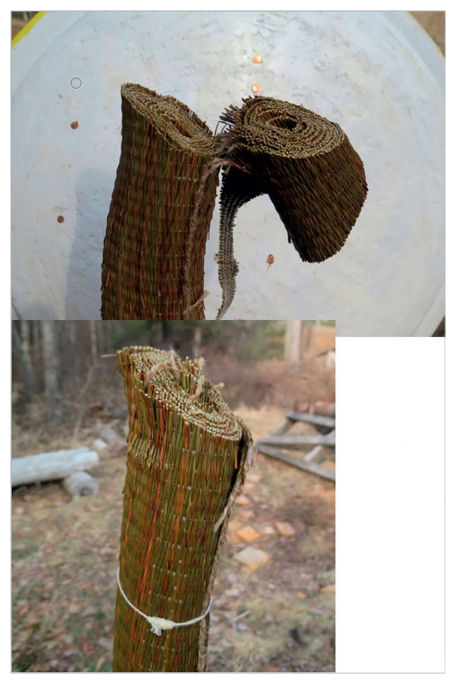
FIGURE 15 Results of test cuts on the tatami mats..