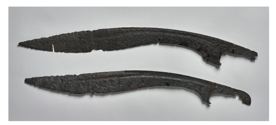
FIGURE 5 Set of two falcatae from the fifth century excavated in southern Spain (British Museum cat. nos. WG2427 and WG1955). Both display similar morphological characteristics, such as very wide blades, thin tangs, small handles, and simple fullers (Image ©Trustees of the British Museum).

FIGURE 4 Set of two falcatae from the fifth century excavated in southern Spain (British Museum cat. nos. 1890.8-10.2 and WG1954). Both display similar morphological characteristics, such as thin blades, tangs that have been welded to separate handles, and simple fullers (Image ©Trustees of the British Museum).