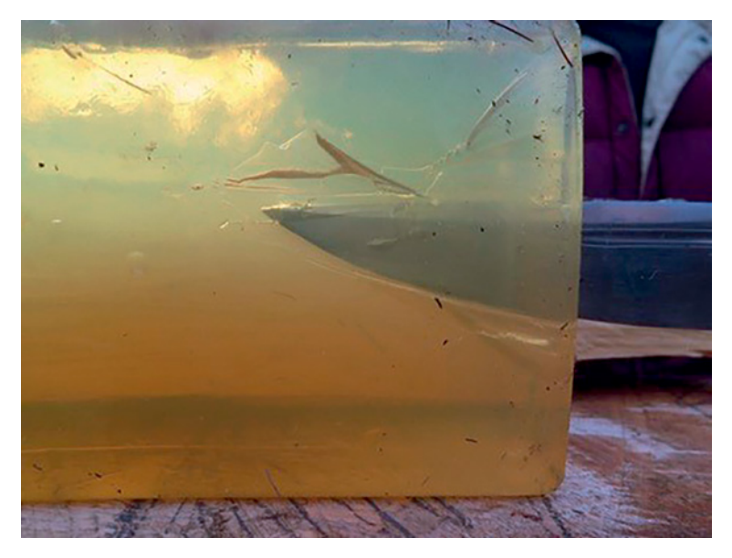
FIGURE 17 Results of a stab into ballistics gel (Author's photo).