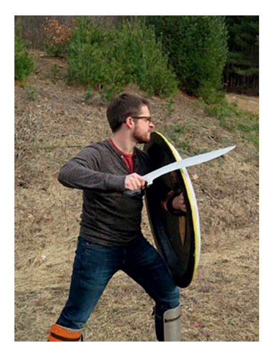
FIGURE 14 Hoplite fighting stance with kopis.

by an enormous margin, since efficacy is not compromised for safety. The iconography also indicates that the backhand was widely used, depicting the starting position of the backhand cut more often than the overhand (Figures 6–10).